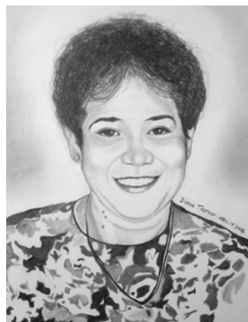
Age Progressed to Age 50