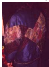
Similar to Jacket Worn, except Pat's background was black